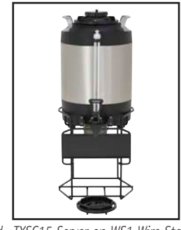
TXSG01 Server on TSS1A Stand. TXSG01 Servers on TSS2A Stand. TXSG15 Server on WS1 Wire Stand.